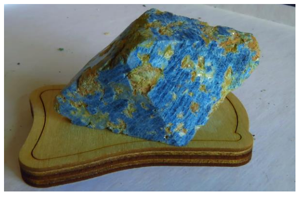
Rutile twin & Lazulite crystal collected & photographed by Ron Ahle