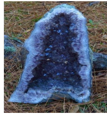
Grand door prize: amethyst cathedral donated by Sue Shrader