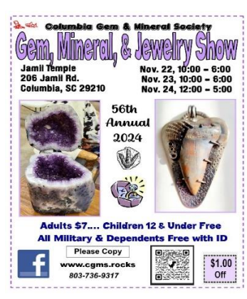
2024 CGMS Gem Mineral Show Flyer